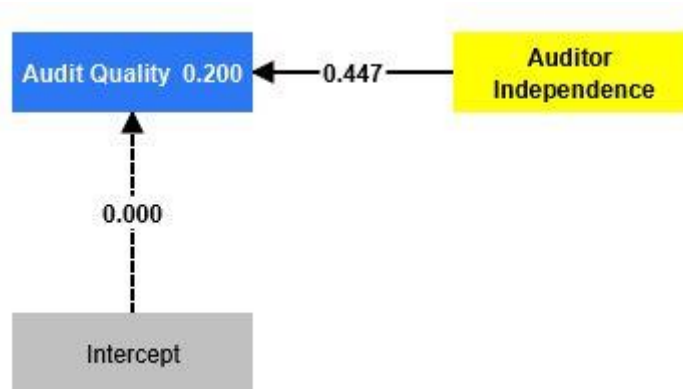
Figure (1): shows influence of AI on AQ